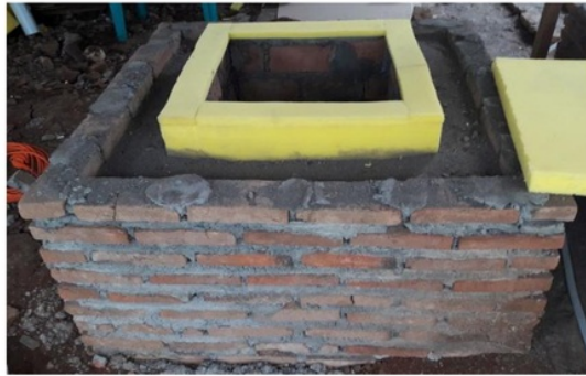
Figure 1. ZECC was placed on the surface